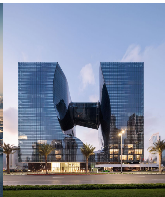
THE OPUS BY OMNIYAT, DESIGNED BY ZAHA HADID