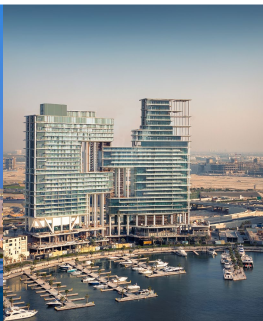
THE RESIDENCES, DORCHESTER COLLECTION, DUBAI